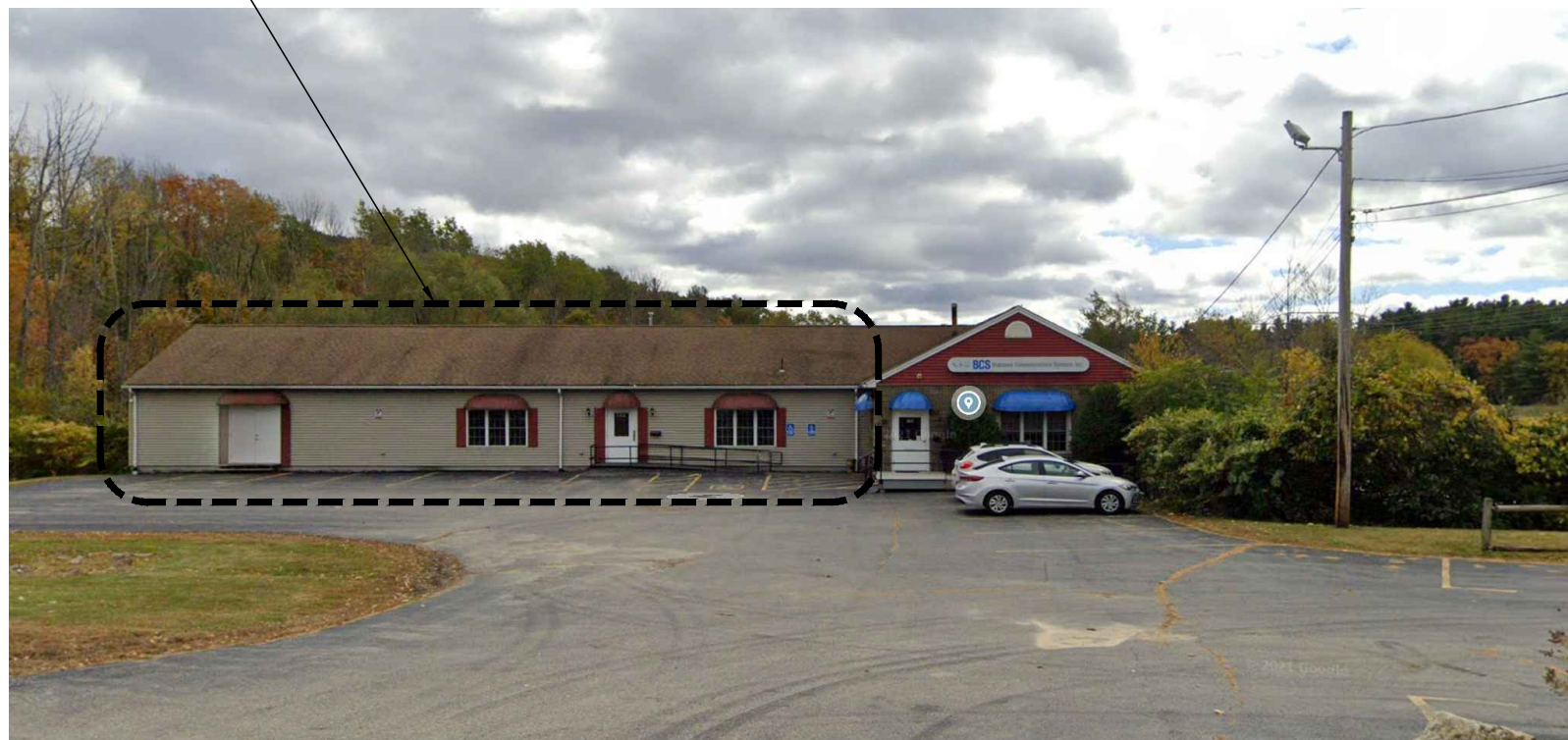
PHOTO OF EXISTING BUILDING

STAFF PARKING REQUIRED FOR LEARNING CENTER..... 8 STAFF MAXIMUM 8 SPACES PROVIDED ON SITE