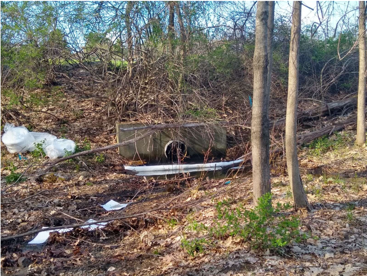
Storm Drain Outfall