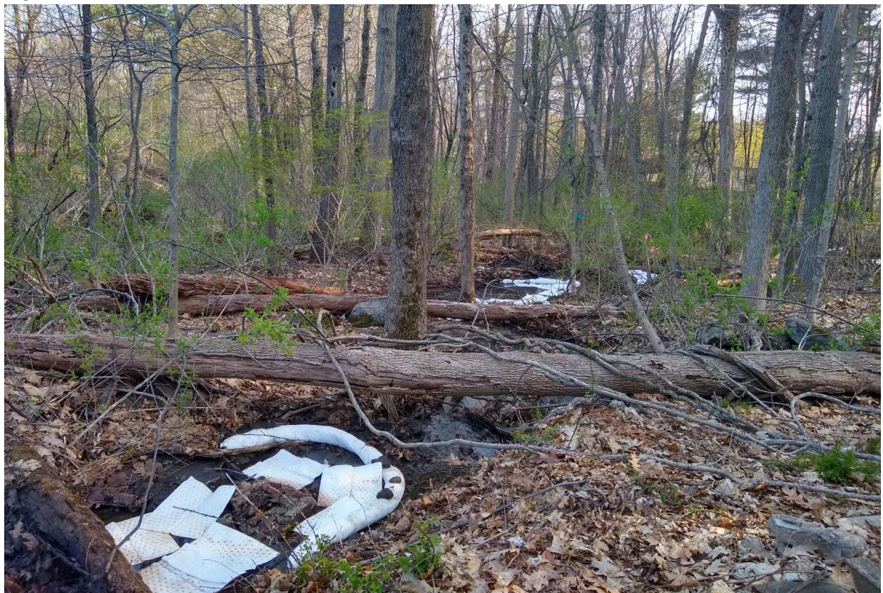
Representative view of pads and boom in drainage channel.