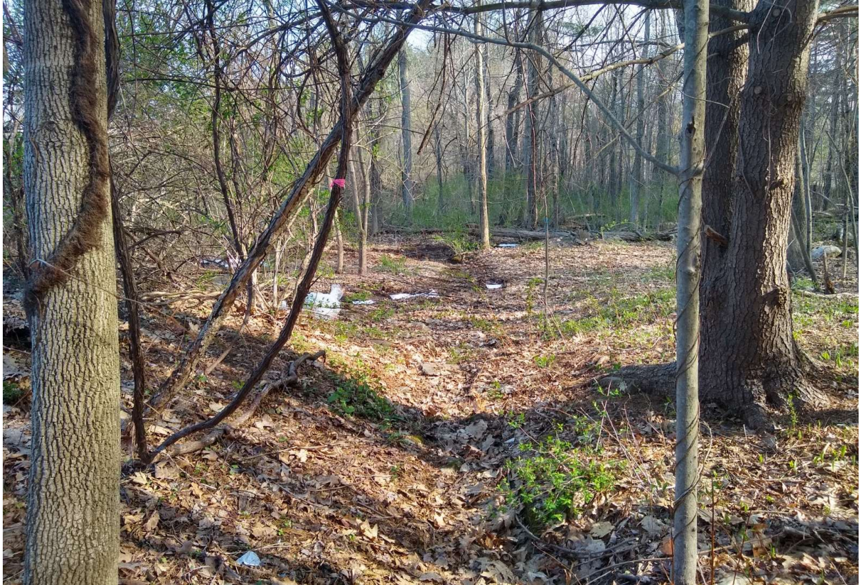
View looking toward storm drain outfall, which is at center left of photo, demonstrating that flow originates from the storm drain.