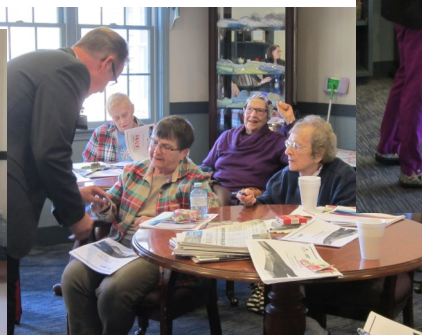
Difference between heart attack and stroke presentation