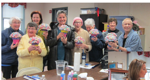
Leicester Fire Dept. Senior