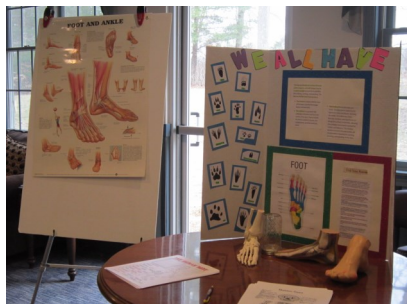
Leicester Health Fair