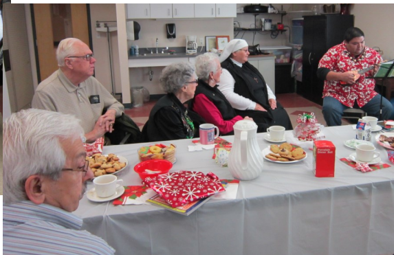
Grief Session Christmas Party