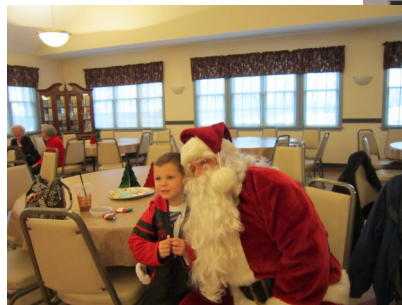
Second Graders Entertain and Meet Santa