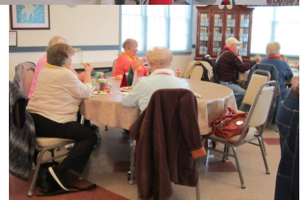
New Year's Eve—Bingo Party