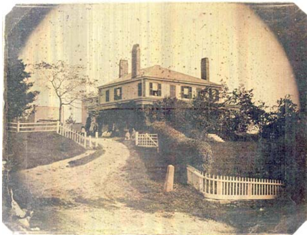
May House, undated stereo slide

A list indicating the full range of available governmental and non-profit sources of funding is found in Appendix B.