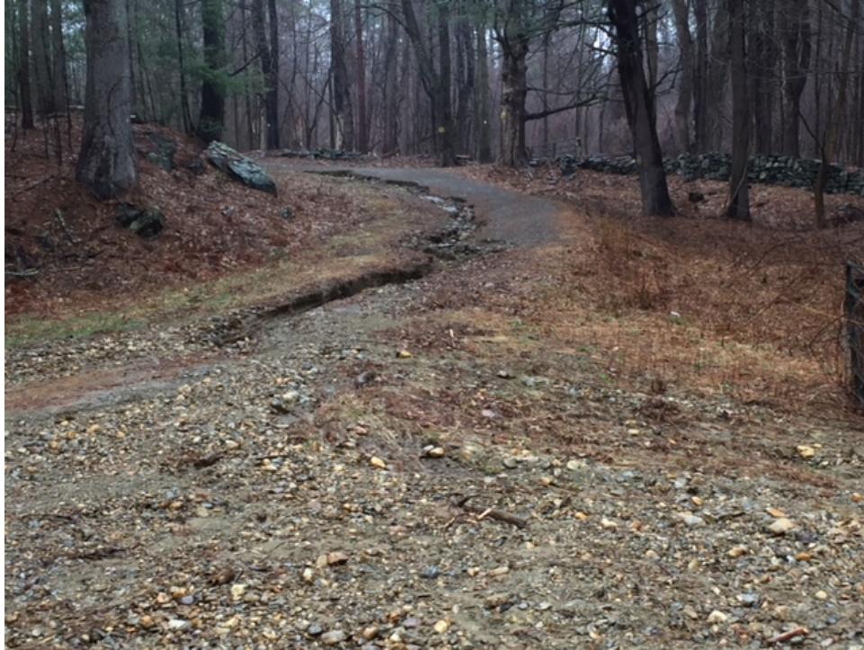
View looking East up Sylvester Street