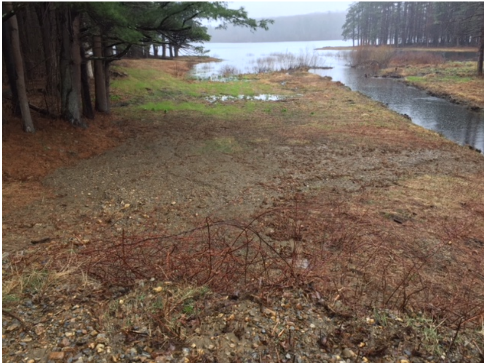
View looking South at impacted land