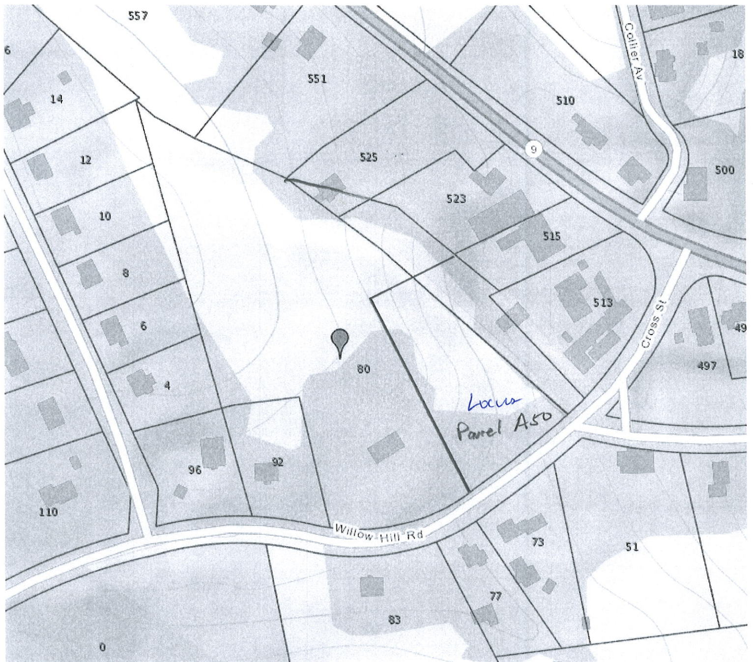
Leicester GIS Map