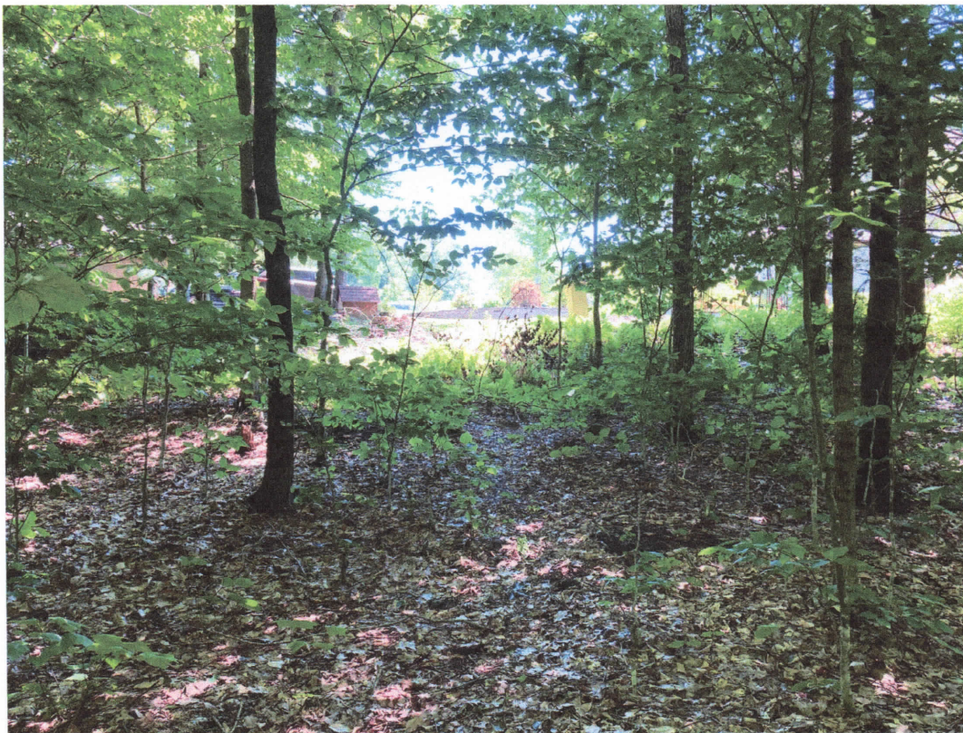
Photo 1 taken by EBT, Inc. on 7/18/2020 – Showing the wooded area north of the house looking towards the driveway.

Site: 7 Sandy Circle, Leicester Applicant: Bethany Salek