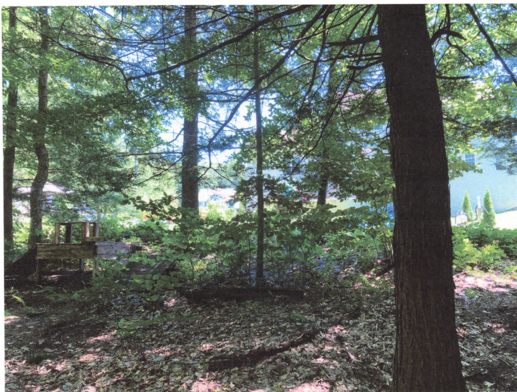
Photo 2 on 7/18/2020 – Showing the wooded area northwest of the house looking towards the house.