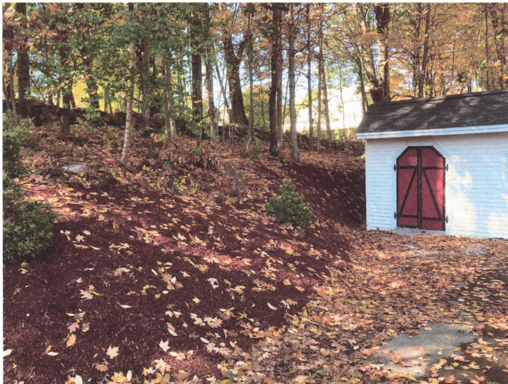
Photo 2 taken by EBT, Inc. on 10/19/2020 – Showing shed moved 11 feet to the west. There is a crushed stone pad to the west of the shed and in front of the shed. The shed is now approximately 6 feet west of the wetland where previously the eastern end of the shed was approximately 6 feet in the wetland.