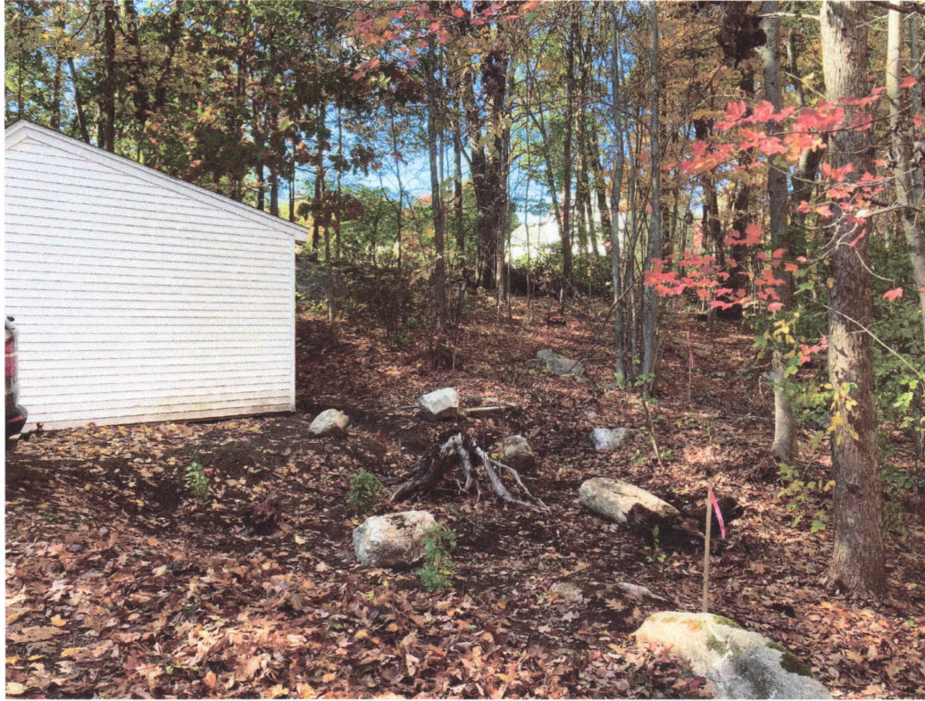
Photo 1 taken by EBT, Inc. on 10/19/2020 – Showing wetland restoration area, in area as depicted on the site plan. Planted with plants indicated on attached sales order from NEWP. Two stumps and boulders were also added to the restoration area. Per the Order of Conditions, several large boulders were placed along the edge of the lawn.