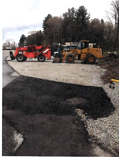
Gravel Parking Area and Catch Basin