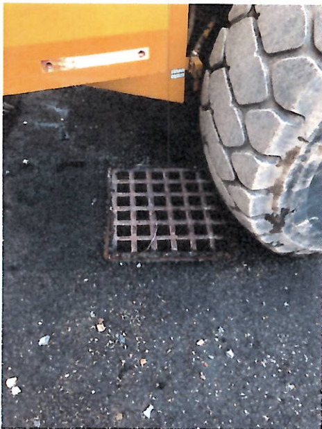
Stormwater Catch Basin