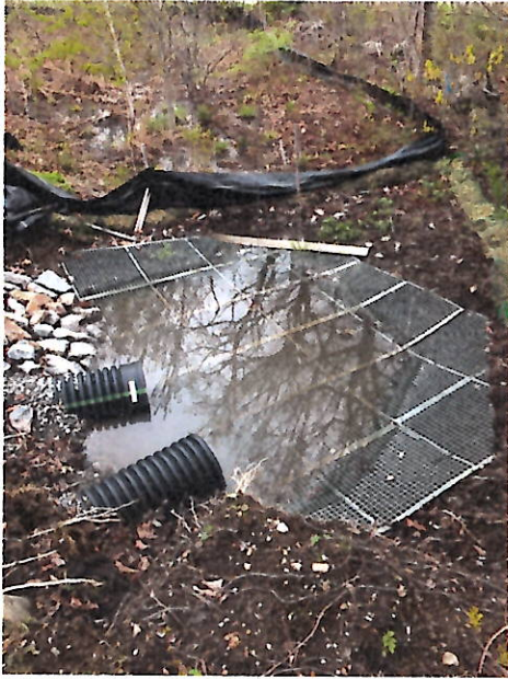
Rain Garden Outlet Energy Dissipation Mat