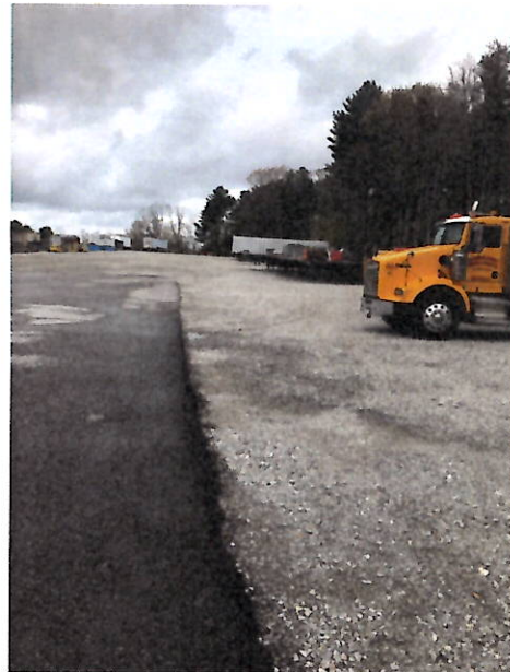
Gravel Parking Area