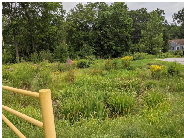
Rain Garden 2