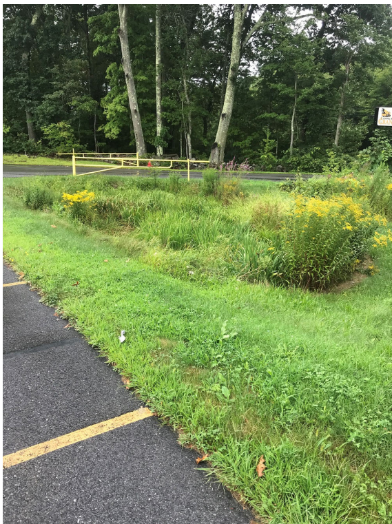
Rain Garden 2