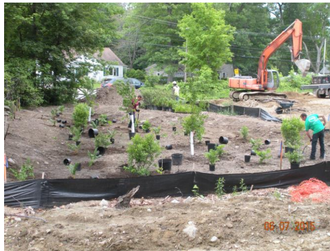
2. Replication area planting