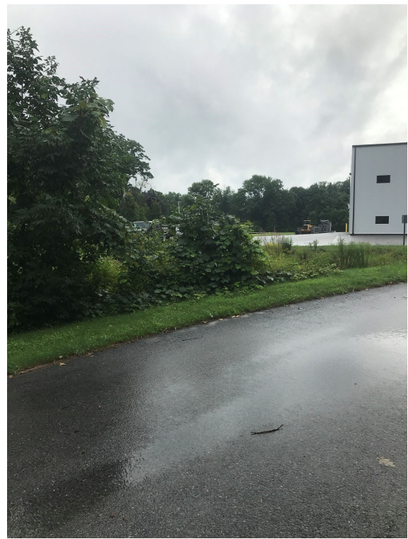
Rain Garden 2