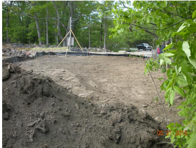
1. Replication re-graded per plan