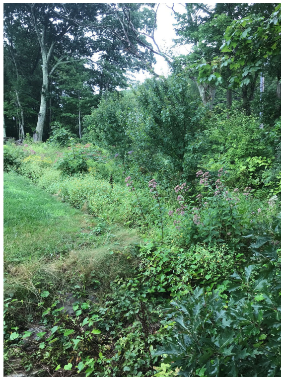
Wetland Replication Area