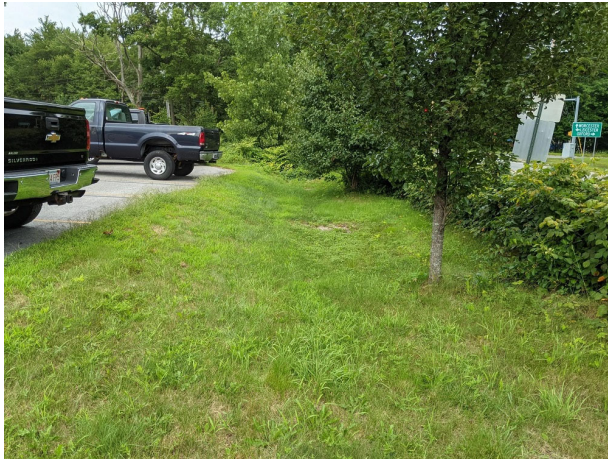
Rain Garden 1 Grass Channel