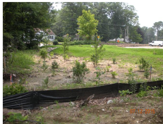
3. Finished replication area planted and sideslopes stabilized