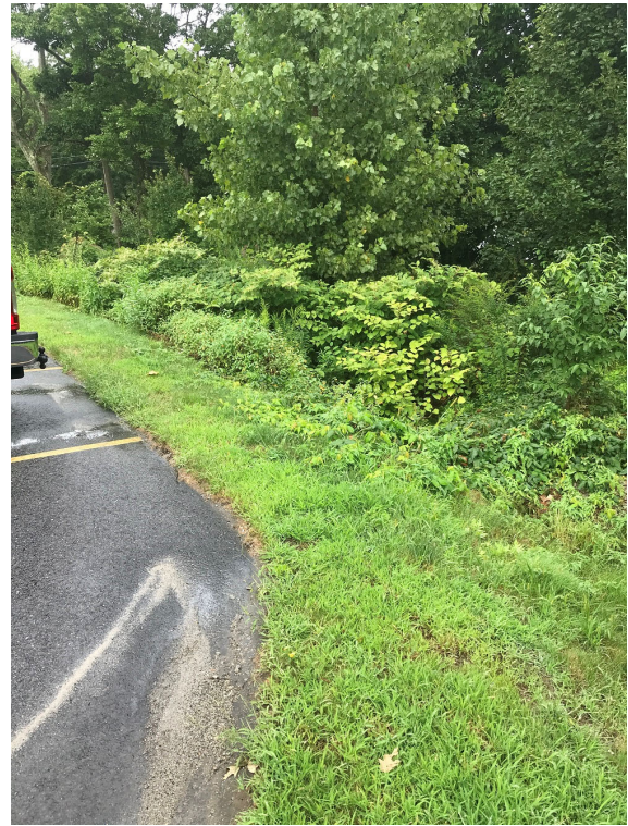
Rain Garden 1